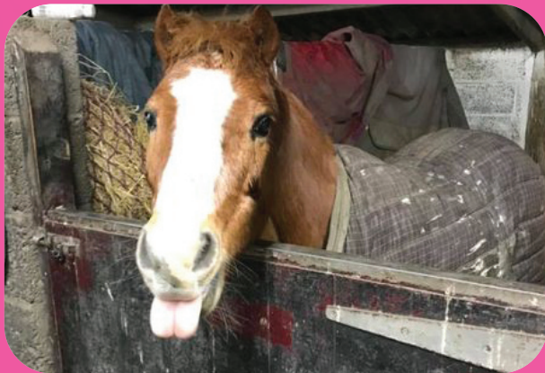
"A Happy 35 year old pony thanks to Equine OAP"